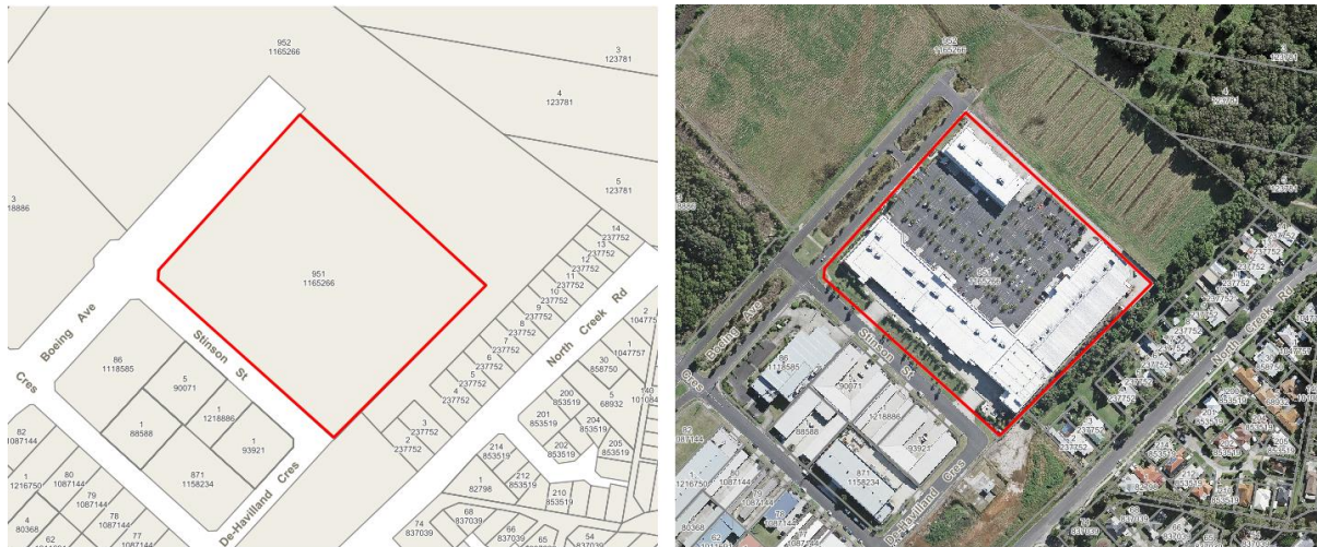
Figure 1: The subject site, outlined in red

The zoning of the land is shown in Figure 2 below.